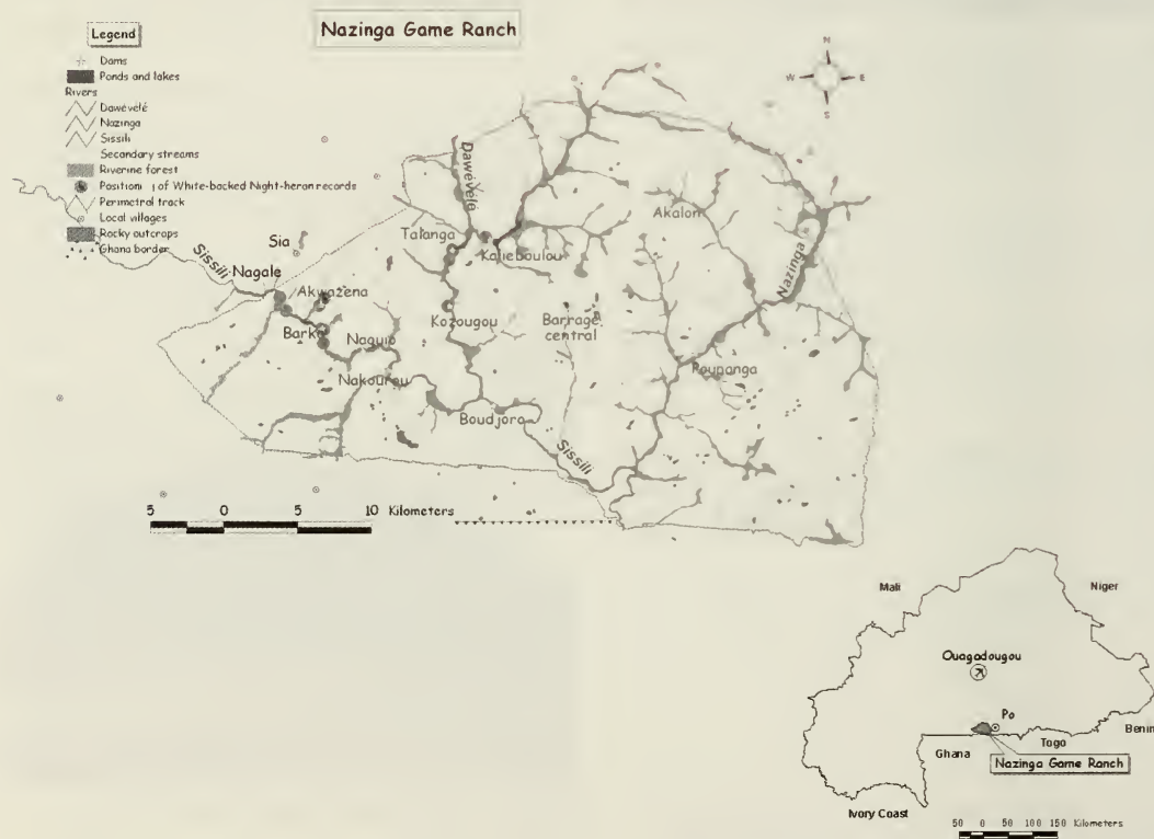
Figure 1. Location of Nazinga Game Ranch in Burkina Faso and detailed view with rivers, forest galleries (adapted from Dekker 1984) and location of White-backed Night Heron Gorsachius leuconotus records.

prises, of which confirmation of the occurrence of White-backed Night Heron Gorsachius leuconotus was one of the highlights.